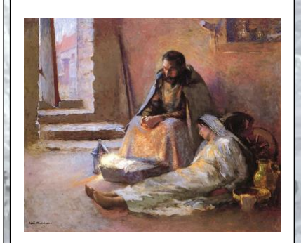
"The Nativity" Gari Melchers (1891)

Christmas is a time of hope, peace, joy, and love and I wish you all of it however you choose to celebrate this season with family and friends.